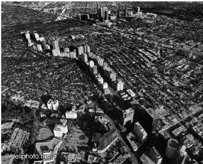
Wilshire Boulevard, Los Angeles' linear downtown

Los Angeles is known throughout the world as an auto-oriented city, yet for the past three decades the region has invested billions of dollars into an ambitious rail and busway network. Given such a significant investment, many find it perplexing that rail service still only partially traverses Wilshire Boulevard, the region's most densely developed and heavily travelled transit corridor. We examine how conflicting political interests manipulated planning analyses and repeatedly dictated highly technical aspects of the subway's routing and design, ultimately delaying the construction of a rail line along the most promising transit corridor in Los Angeles.