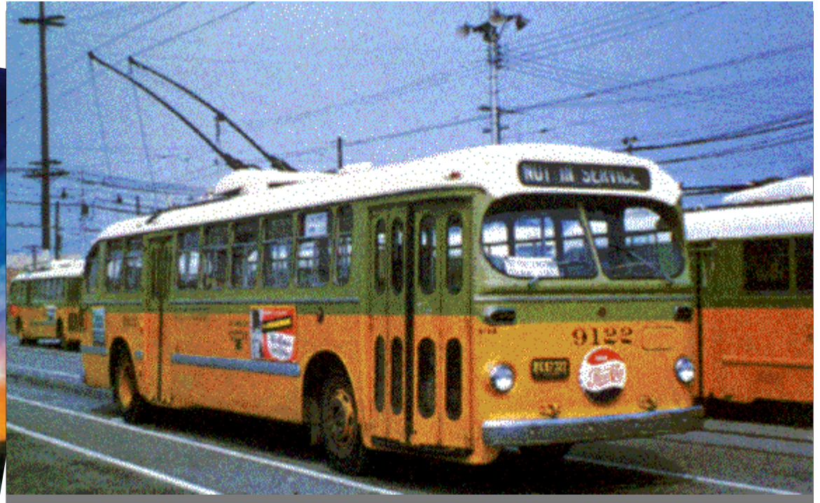
Los Angeles Transit Lines - The Trolley Bus; One of the final 30 delivered to Los Angeles in 1948